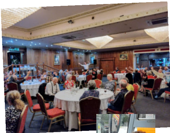
A sing along after dinner.