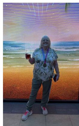
Nice sunset for Hopton