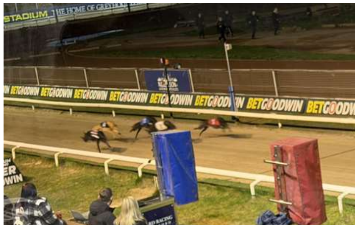
It looks a close run thing between them all

Only 11 of us braved the February dark night and headed off to the races. There were definitely a few 'dark horses' on the winnings front with some not disclosing their luck - or not but most people seem to have had a little bit extra to take home or just broke even. It was a lovely sociable evening with burger and chips to take away the hunger pangs and a drink to wash it down as well as the first bet being free. We stood to make a minor loss but the coach cost a little less than planned so the event covered itself which is what we prefer to do.