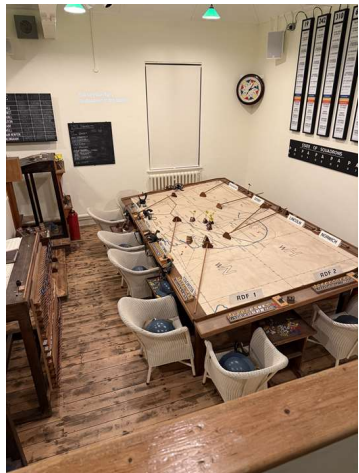
The ops room just as you have seen it in all of the good old war time films.