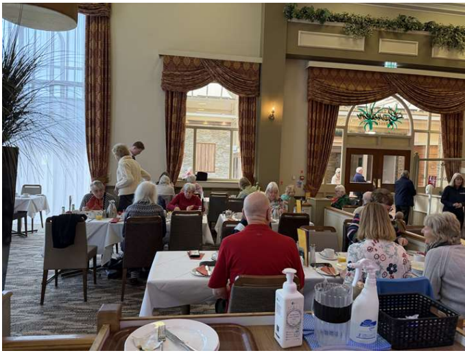
Dining Room at Potters all seated together