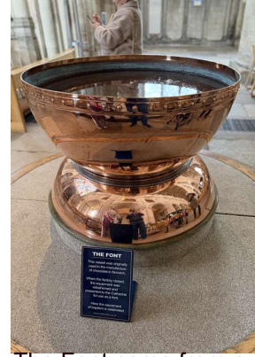
The Font came from a chocolate factory and was used for caramel