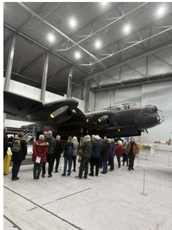
The group receiving a talk on the Lancaster bomber