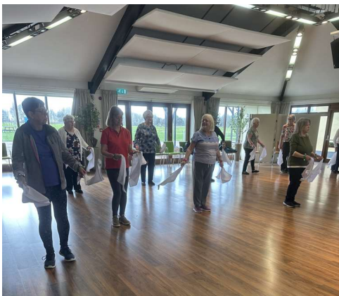
Evergreens Morris dancers with bells and hankies. Well done all.