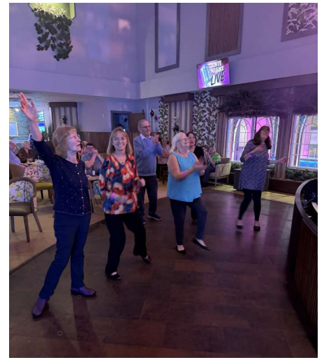
Evergreens sequence team a bit out of step - but who cares!