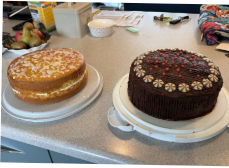
The posh ploughmans and cakes seemed to go down well